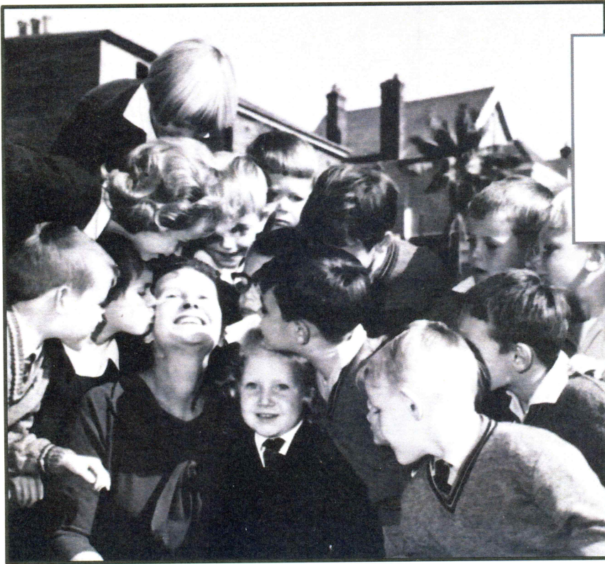
Students from the school's Deaf Unit farewell their retiring teacher, circa 1955.